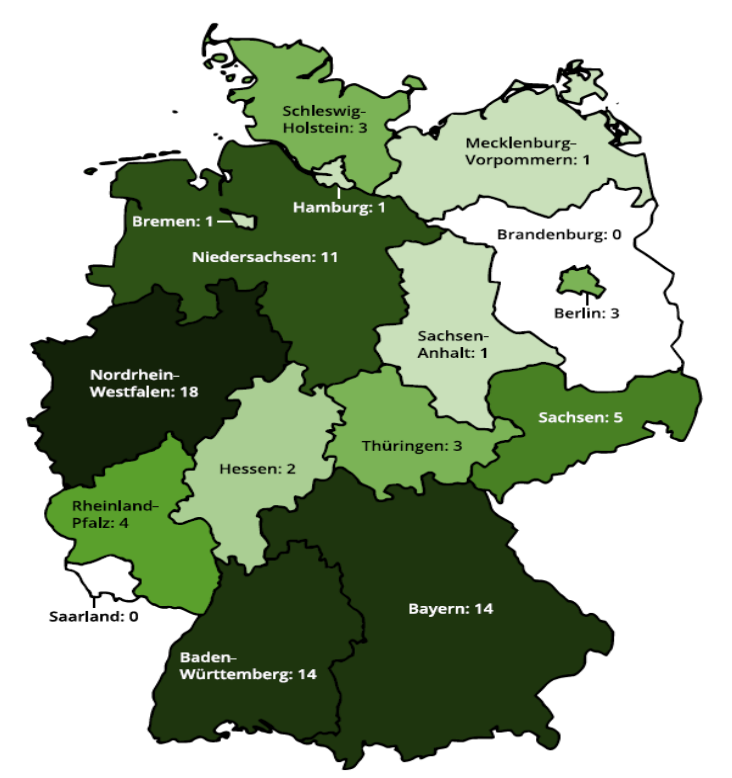
Figure 2: Distribution of participating companies around Germany

Although companies with fewer than 250 employees were specifically targeted, eight of the companies had significantly grown since the creation of the database, having between 250 and 500 employees at the time of the survey. The participating companies were distributed all around Germany (see Figure 2), with the highest concentrations in North Rhine-Westphalia (18), Baden-Württemberg (14), Bavaria (14), and Lower Saxony (11).