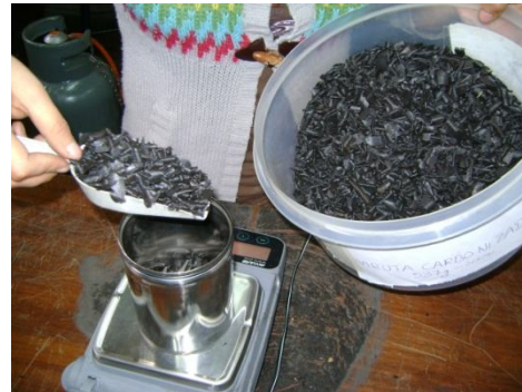
Figure 2. Toasted Biomass

Roasting process comprised of three steps: step of heating the biomass at a rate of 16.5 ° C / minute, roasting stage is performed in 30minutes at a temperature close to 270 ° C and cooling stage which lasts 15 minutes. Toast biomass are removed when the temperature in the reactor is below 150 ° C, see Figure 3.