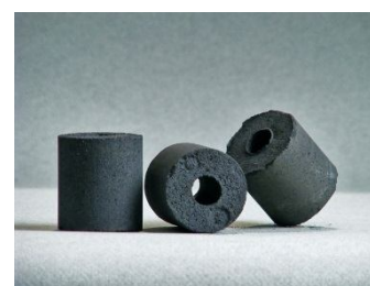
Figure 4 Grinding