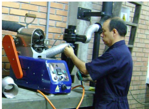
Figure 1. Reactor

The biomass selected were sun dried to remove the surface moisture, after that they were toasted. The roasting was performed in a horizontal cylindrical reactor, batch loading, see Figure 1. The temperature was recorded using a set of k-type thermocouples and the weight of the material was recorded using electronic balance. Proximate analysis was applied to the toasted products and heating value was also determined, see Figure 2. The results are showed in Table IV.