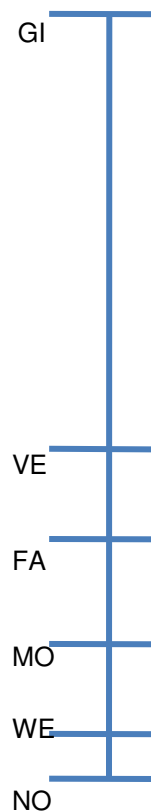
Figure 3: LMS developed to evaluate sweetness. Selected descriptors were, from top to bottom: “dulzor más grande imaginable” (GI), “muy dulce” (VE), “bastante dulce” (FA), “moderadamente dulce” (MO), “débilmente dulce” (WE) and “nada dulce” (NO)