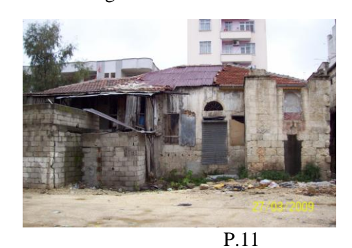
Left and deterioration of the traditional structure