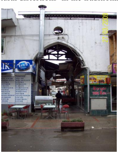
P. 3 The traditional structure and difference function