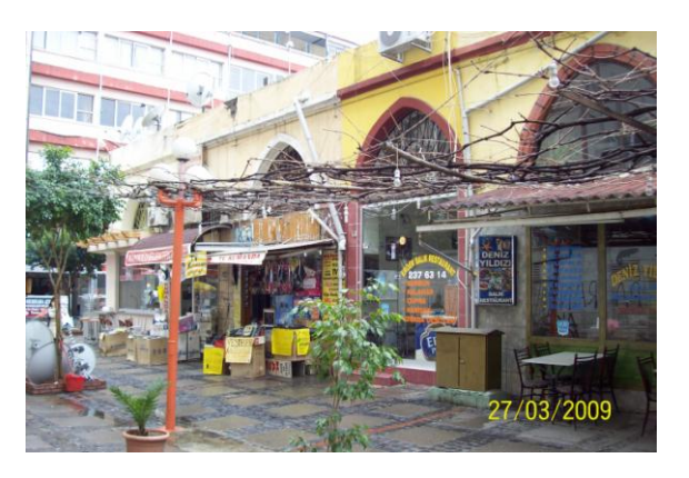
P. 1 P. 2 Functional changes and structural distortions in the traditional structure the urban site area.