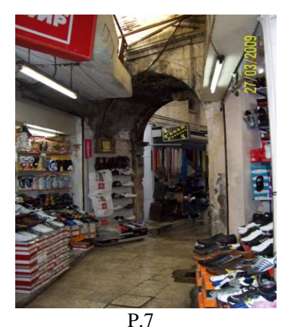
The monumental gate and loss of qualified